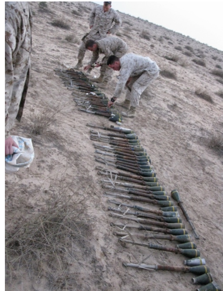
Prepping ordnance for disposal

His transition into humanitarian work began as he signed with PAE, returning to Iraq as a contractor. There, he helped set up an EOD program and worked with Special Operations Forces in Syria, collaborating with Kurdish allies who impressed him with their eagerness to learn. He led an intensive training program, having to condense a 30-day curriculum into just 15-days and conducting real-life situation analysis during nighttime tests to prepare his cohort.