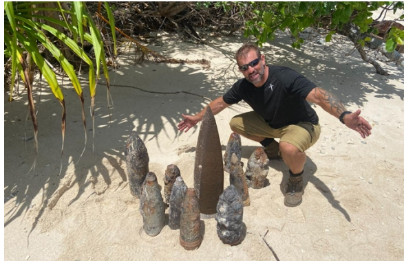
On ops in the Marshall Islands