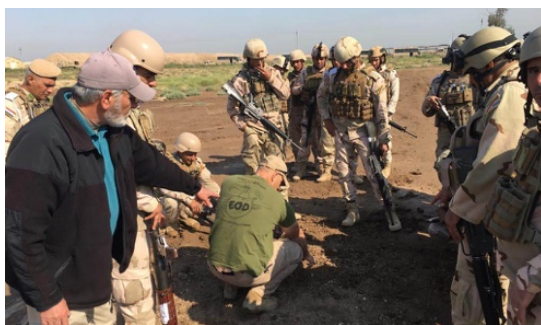
An IED lane with Iraqi soldiers

However, life took a turn during Covid. Dan found himself as a stay-at-home dad for 18 months before venturing into a radically different field — forensic work in Djibouti, which involved processing info and checking evidence of EOD related activities across Africa.