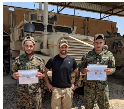
With Syrian Kurd graduates after course completion